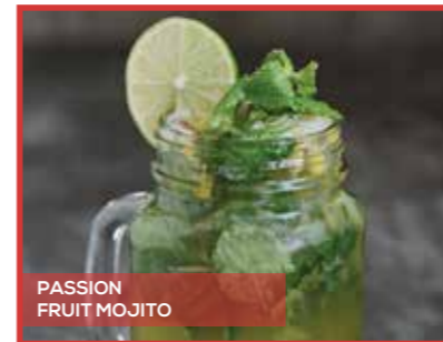
PASSION FRUIT MOJITO