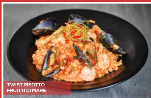
TWIST RISOTTO FRUTTI DI MARE