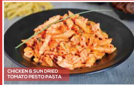
CHICKEN & SUN DRIED TOMATO PESTO PASTA