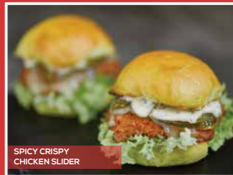
SPICY CRISPY CHICKEN SLIDER