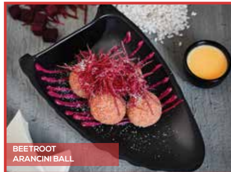
BEETROOT ARANCINI BALL