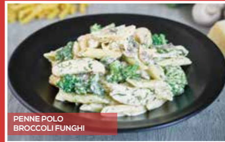
PENNE POLO BROCCOLI FUNGHI